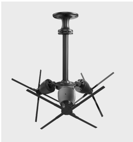
HYPERVSN Triple Mount