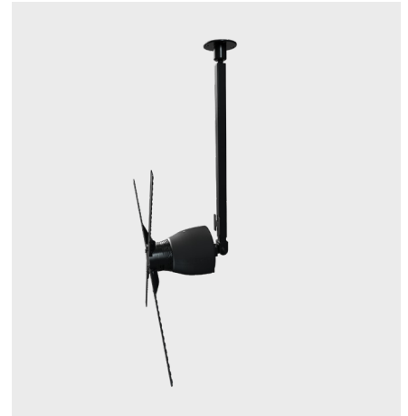
HYPERVSN Ceiling Mount

Create the holographic experiences you have always dreamed of with the custom range of HYPERVSN Solo Accessories. Designed to expand your installation opportunities and bring a new level of convenience and versatility to your set up. These accessories offer you everything from floor and ceiling mounts to multiple portable solutions, allowing you to plug-and-play with ease.