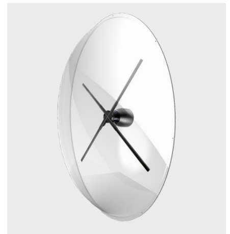
HYPERVSN Dome Ultra