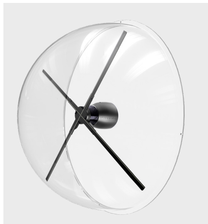
HYPERVSN Dome L