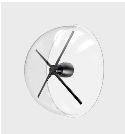
HYPERVSN Dome M